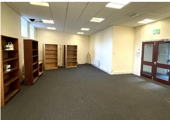
Ground Floor – Office 11