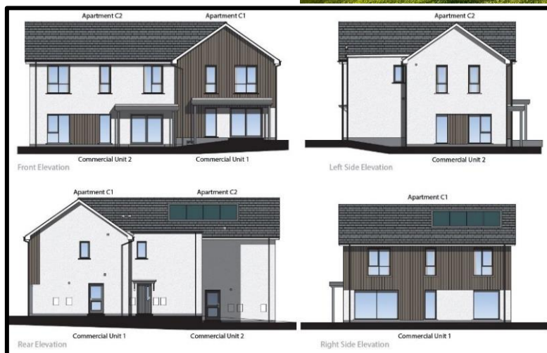
Units 1 & 2 Elevations