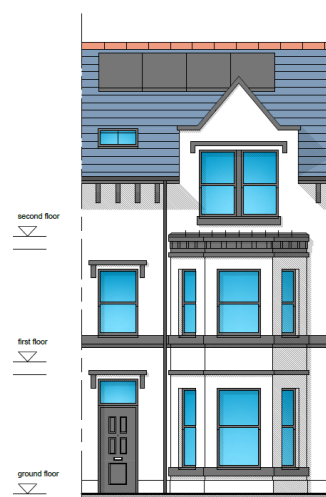
proposed typical front (south) elevation with colour