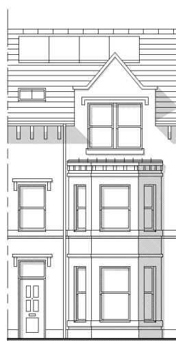
proposed typical front (south) elevation