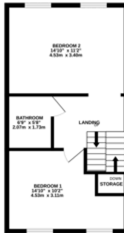
1ST FLOOR 416 sqft (38.6 sqm) approx.